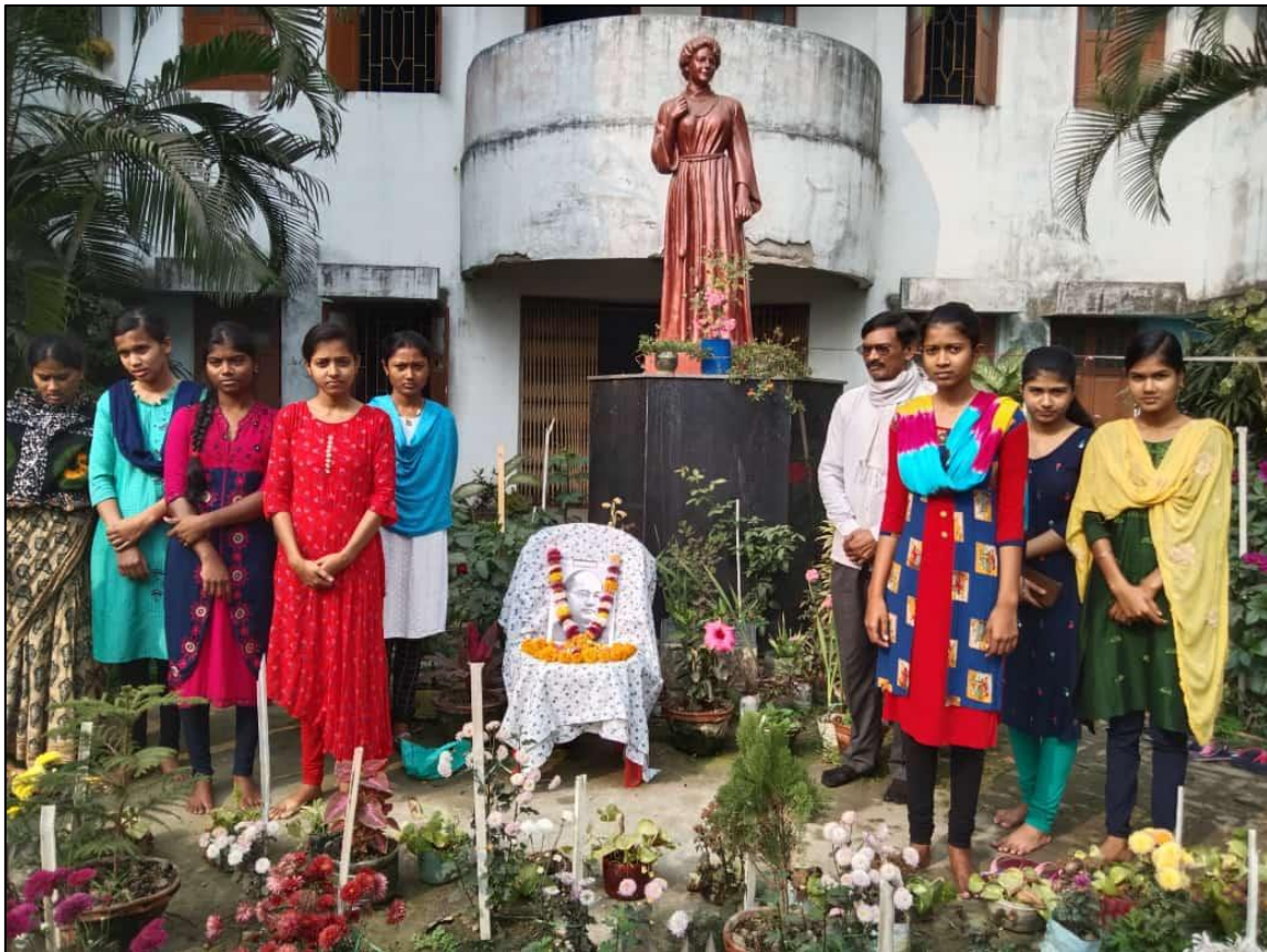
Our Girls, Our Strength