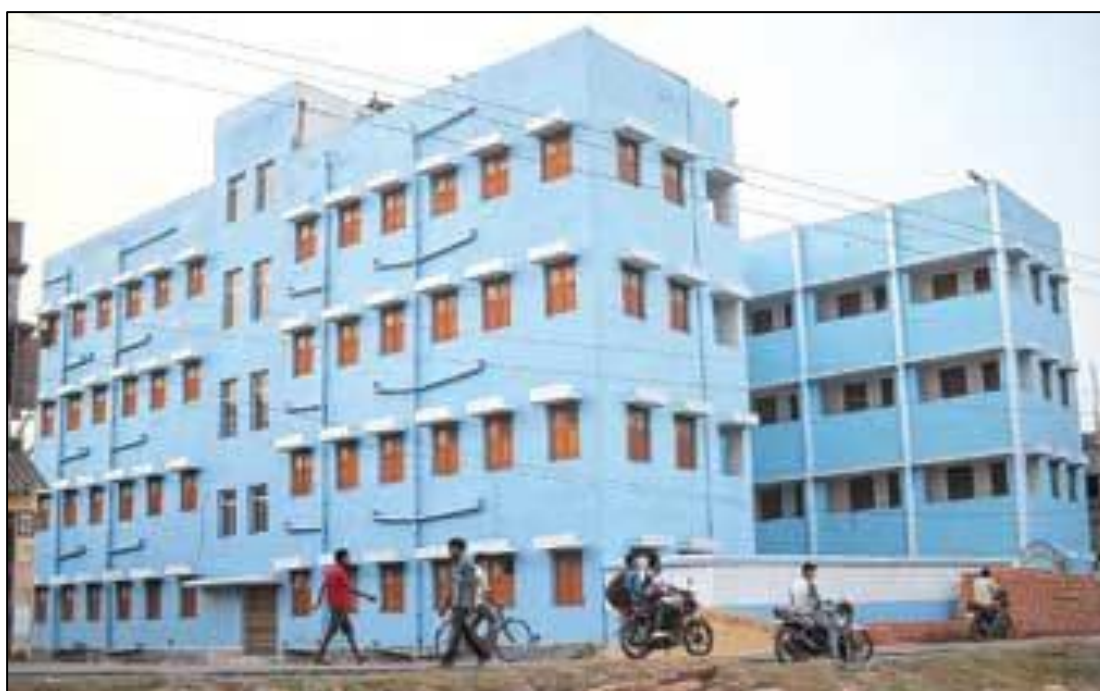
Lateral View of Nivedita Bhawan

There is total 56 rooms in the Girls hostel which include one Warden's residence room. All the rooms are self-contained. Rest 53 rooms are available for hostel admission. The total capacity of Girls hostel is 159 students. At present there are 20 students in the hostel. There is mess attached to the girl's hostel. The seating capacity of the mess is 100 students. All 20 students are taking their meals in the mess.