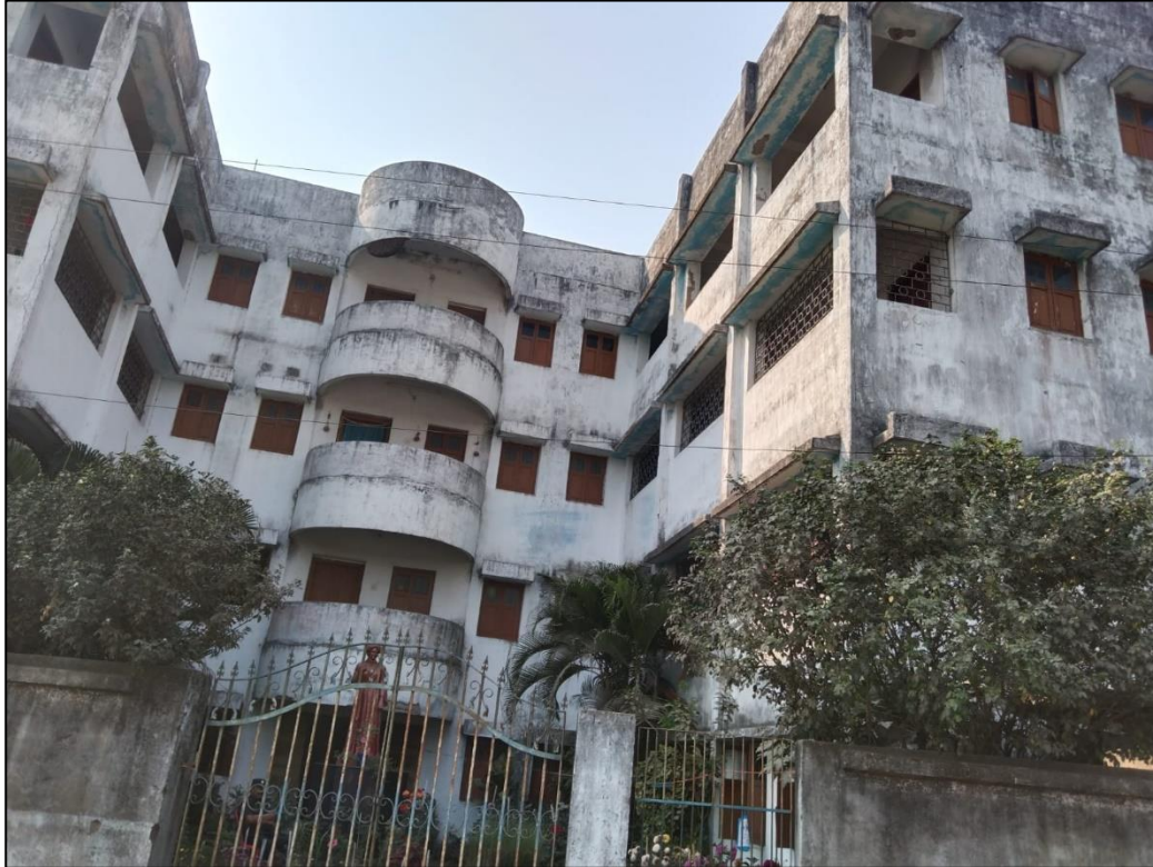
Front view of Nivedita Bhawan

Accommodation is available for 159 students. Hostel building is new, modern, spacious and adjacent to the college. The rooms are properly ventilated and provided with fans, tube lights and furnished with cots, cupboards (lockers), a chair and a study table. Hostel has a spacious dining hall where daily meals are served at reasonable rates. (Fixed by management on contract basis.). Also, the hostel is well secured and guarded for 24 hrs.