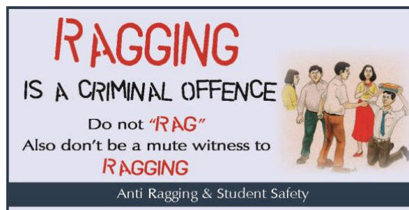
Some of the posters of Ragging and Anti-Ragging